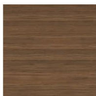
Solid wood Walnut Canaletto

Materials, fabrics, leathers, colors and finishes are approximate and may slightly differ from actual ones. You can find the complete collection of Bonaldo fabrics and leathers on the website https://www.bonaldo.biz/