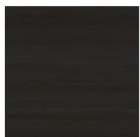
Solid wood Coal ash