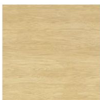
Solid wood Natural ash