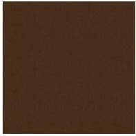
Painted metal Mat bronze