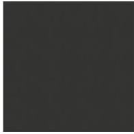
Painted metal Mat lead