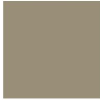
Painted metal Mat pearl gold